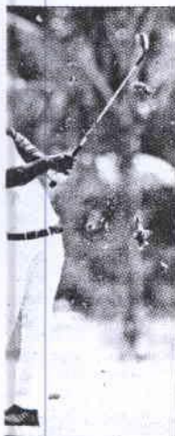
Bangladesh claimed his Asian Tour victory at pen.