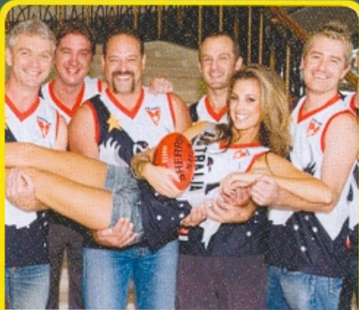
The Vietnam swans ▶ P.4