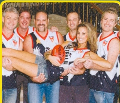
The Vietnam swans ▶ P.4