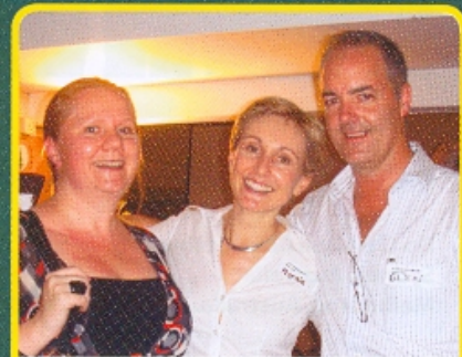
AusCham EGM Sundowners ▶ P.21