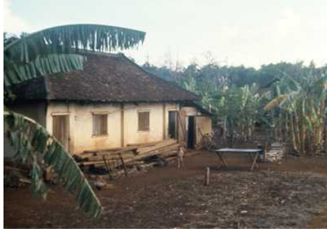
Binh Ba, Vietnam. 1969. A house in the village.

Some 600 m south of the village a machine gun fired near a flanking tank. In reply, four shotgun-type 83.4 mm cannister and 1000 tank machine gun rounds silenced this opposition. The tanks halted about 300 m from the nearest houses and the infantry dismounted and spread out between the APCs. Desultory enemy RPG fire aimed at the tanks began, but the RPG gunners were shooting beyond effective range. The tanks returned fire, but an RPG then fired from the next house. It was not until the tank commanders began noting the house from which fire emanated, pausing, then firing at the next house that RPG fire decreased.