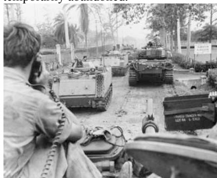
Binh Ba. Centurion tanks from 1st Armoured Regiment, and armoured personnel carriers (APCs) from B Squadron, 3rd Cavalry Regiment, move along the main road of the village past Plantation Gallia. Armour together with infantry dislodged a strong North Vietnamese Army (NVA) group which had entered the village.