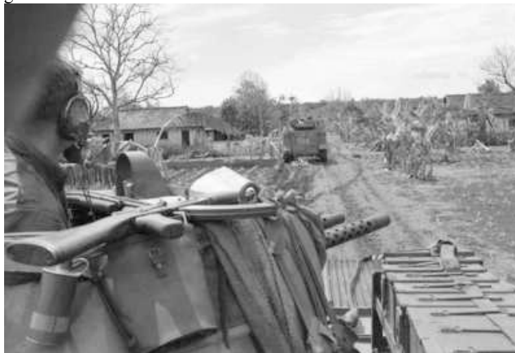
Binh Ba, South Vietnam. June 1969. Commander of an armoured personnel carrier (APC) of B Squadron, 3rd Cavalry Regiment, keeps a sharp look out into a banana plantation on the roadside near Binh Ba. Australian troops inflicted heavy casualties on a North Vietnamese Army (NVA) Force which entered Binh Ba, five miles north of the 1st Australian Task Force base at Nui Dat.

The tank's arrival alerted the Vietnamese Regional Force (RF) Company who prepared to react against an enemy of (at that time) unknown strength. In parallel, the tank's contact report sent by radio to the 1st Australian Task Force (1 ATF) base and a request for assistance from the Vietnamese District Chief resulted in the task force's ready reaction force -- based on D Company 5 RAR -- being mobilised at about 9 am.