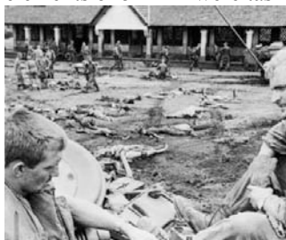
BEL/69/0388/VN. Binh Ba, South Vietnam. June 1969. Bodies of dead North Vietnamese Army (NVA) troops who attempted to hold the rubber plantation village are laid out in an open area so they can be checked for documents before burial.

At 6 am next morning, 7 June, B Company to the south of Binh Ba engaged an enemy force of company strength after first mistaking them for friendly Vietnamese soldiers—at first both sides waved to each other! As D Company now prepared to sweep through Binh Ba village in a final clean-up, some 80 enemy were observed in a rubber factory at Duc Trung, 1000 m north. A Vietnamese reaction force assisted by elements of 5 RAR were tasked but the enemy slipped out of the noose.