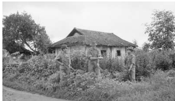
AWM MISC/69/0525/VN. Binh Ba, South Vietnam. At the rubber plantation village.

The peaceful morning air of Phuoc Tuy Province in South Vietnam was shattered at 7.20 am by a rocket-propelled grenade (RPG) striking the turret of an Australian Centurion tank as it entered the village of Binh Ba, some six kilometres north of the Australian base at Nui Dat. Forty-eight hours later, the vicious Battle of Binh Ba concluded leaving one Australian dead and 10 wounded, but at least 107 enemy killed, six wounded and 29 detained for further investigation. This battle on 6 June 1969 was an undeniable success for the Australians and ranks as one of the major military victories of that force during the Vietnam War.