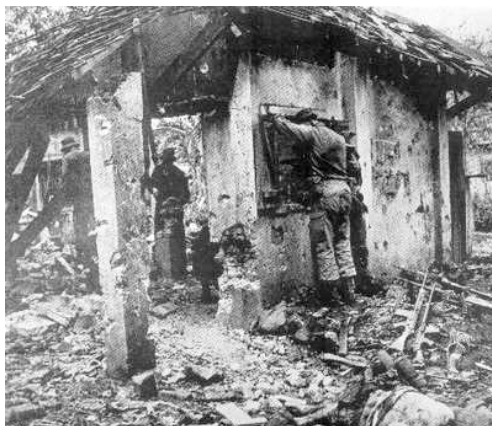
These are the times that try men's souls. T Paine. From The Year of the Tigers , edited by Captain MR Battle, 1970. p56.

About 1 pm, heavy firing broke out around Duc Trung village to the north and the District Chief reported that the RF platoon had been overrun by about 100 enemy. Artillery fire was brought down amongst the withdrawing enemy on the northern edge of the hamlet whilst helicopter gunships assisted in containing them till B Company 5 RAR with four tanks arrived within 20 minutes. The southern part of Duc Trung was then secured, but the enemy was so intermingled with the civilians in the north that it was agreed RF troops should conduct the sweep of that area. Artillery and Bushrangers continued to harass the withdrawing enemy. Arthur Burke at the gun end of 105th Battery wrote, 'We've fired more rounds in the last 48 hours than the first 20 days of last month -- 2000 rounds'. B Company blocked northwest of Duc Trung that night.