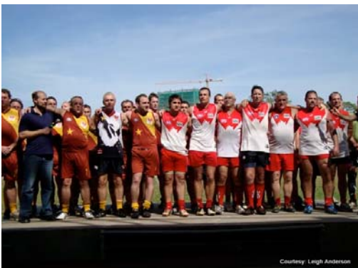
Vietnam Swans sing the national anthem on Anzac Day after someone forgot the CD.

Follow the Swan's exploits on the website http://vietnamswans.com/ . It is the most active website in Asian football. As we can not win a game, we might as well win something.