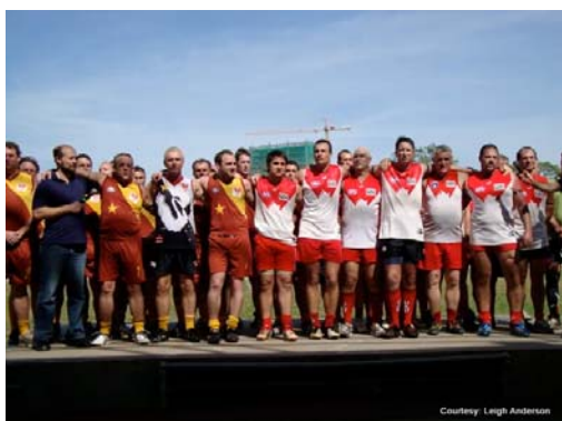
Vietnam Swans sing the national anthem on Anzac Day after someone forgot the CD.

Follow the Swan's exploits on the website http://vietnamswans.com/ . It is the most active website in Asian football. As we can not win a game, we might as well win something.